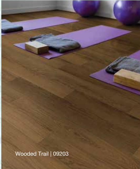
Wooded Trail | 09203

The swirling grain and distinctive character inherent in authentic hardwood is beautifully captured and comes in two distinct plank sizes: 7" x 48" & 9" x 60".