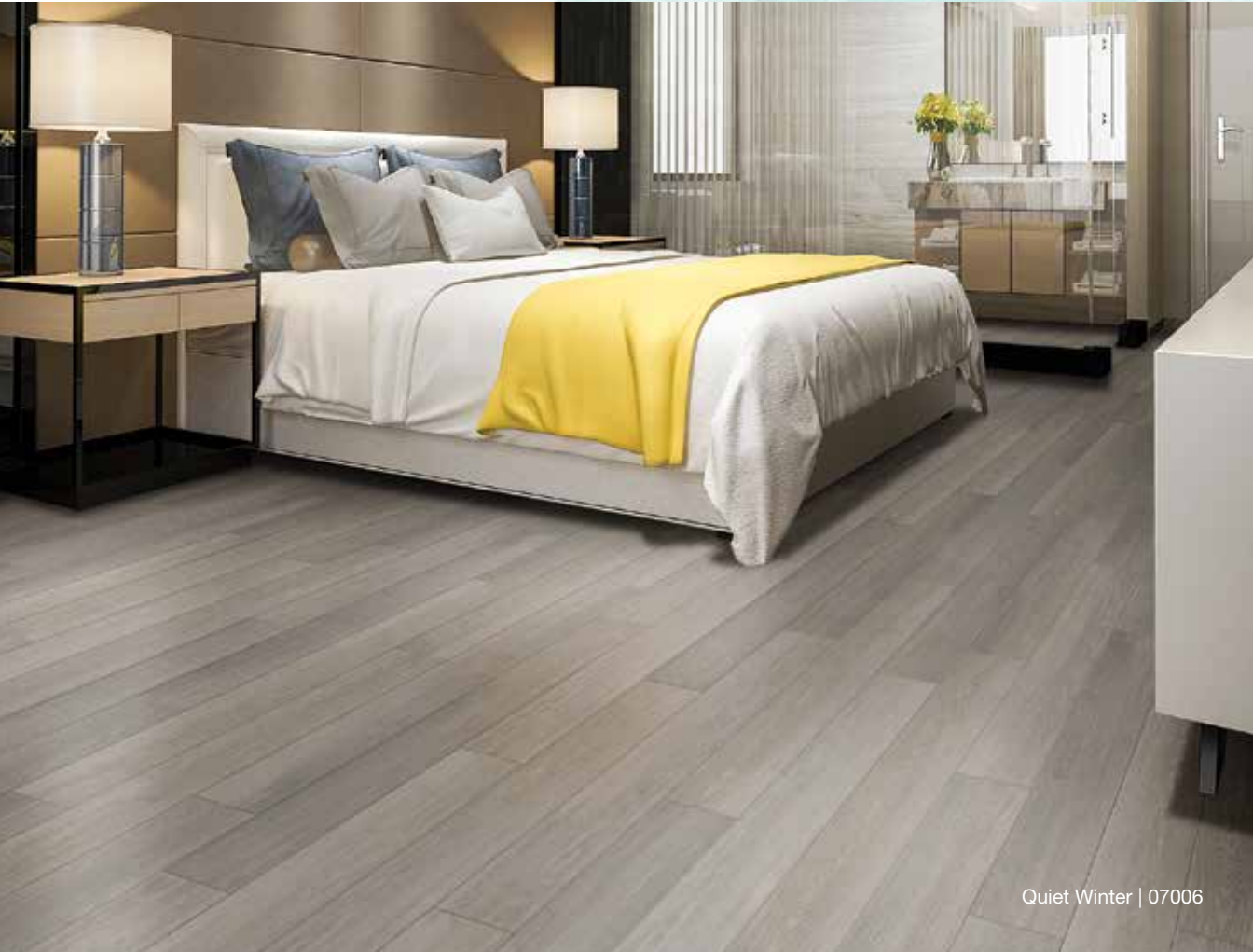
Quiet Winter | 07006