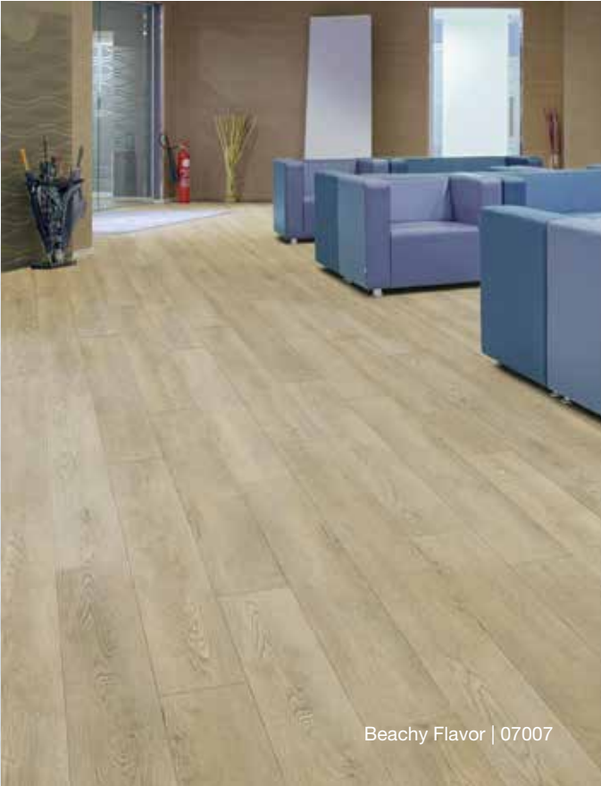
Beachy Flavor | 07007