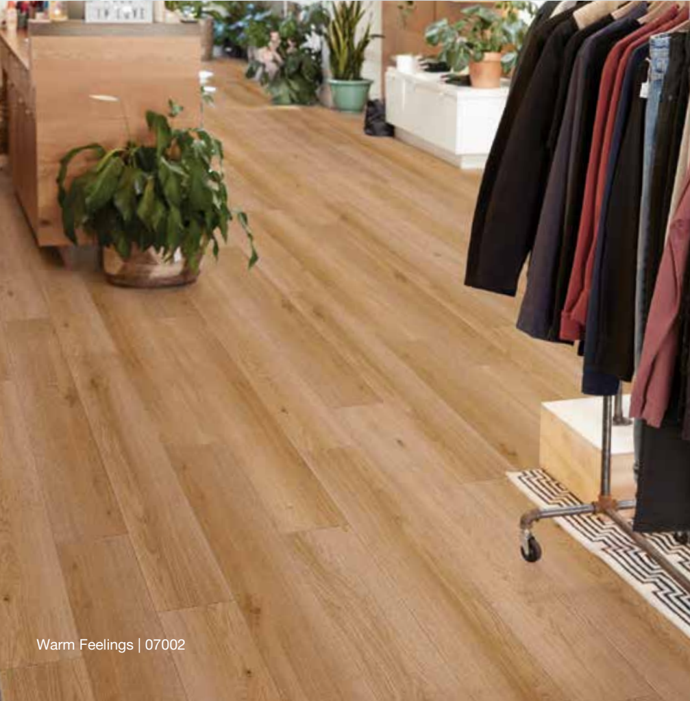
Warm Feelings | 07002