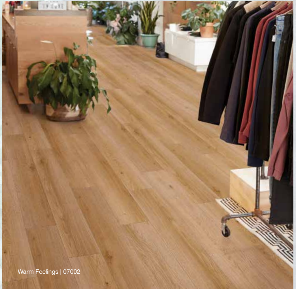
Warm Feelings | 07002