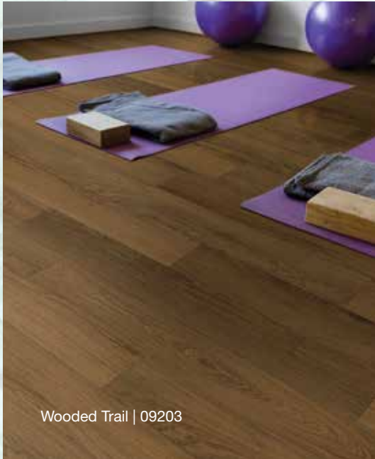
Wooded Trail | 09203