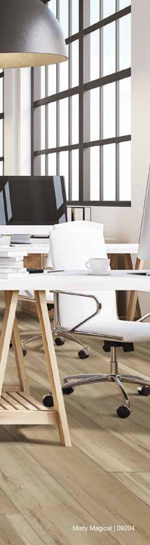
Misty Magical | 09204