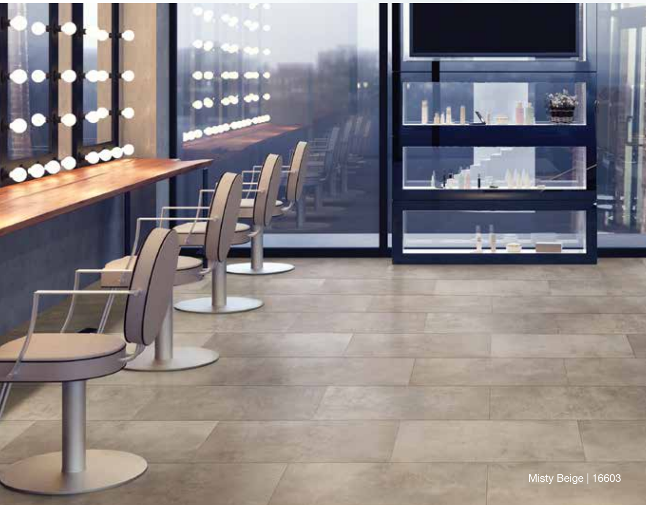
Misty Beige | 16603