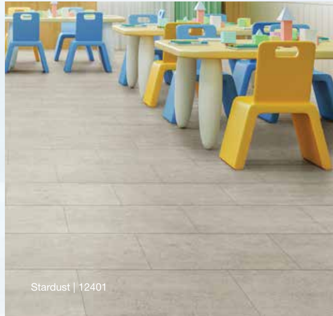
Stardust | 12401

Inspired by the subtle, visual texture found in stone, our collection of tile visuals come in a variety of tranquil colors and is available in two sizes: 12" x 24" & 16" x 32".