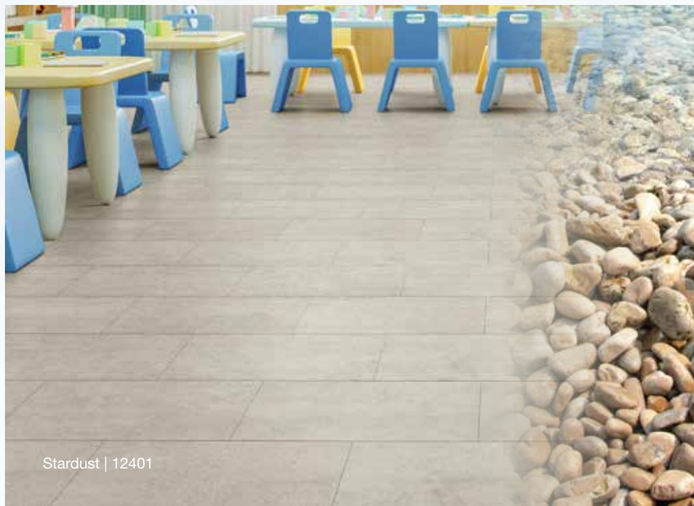
Stardust | 12401

Finding the perfect design is easy; but finding the right flooring type can be a challenge. With Nod to Nature every design comes in three distinct structures: Rewilding ™, Dry Back Traditional LVT; Individuality ™, Loose Lay Thick LVT; and Visionary ™, Rigid Core. Never again will you have to sacrifice style to accommodate the installation.