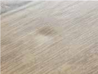
Competitor's Dry Back LVT

Each Dry Back LVT product had a 1lb steel ball dropped from higher than 5 feet.