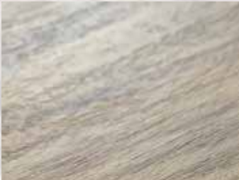
Rewilding™ Dry Back LVT